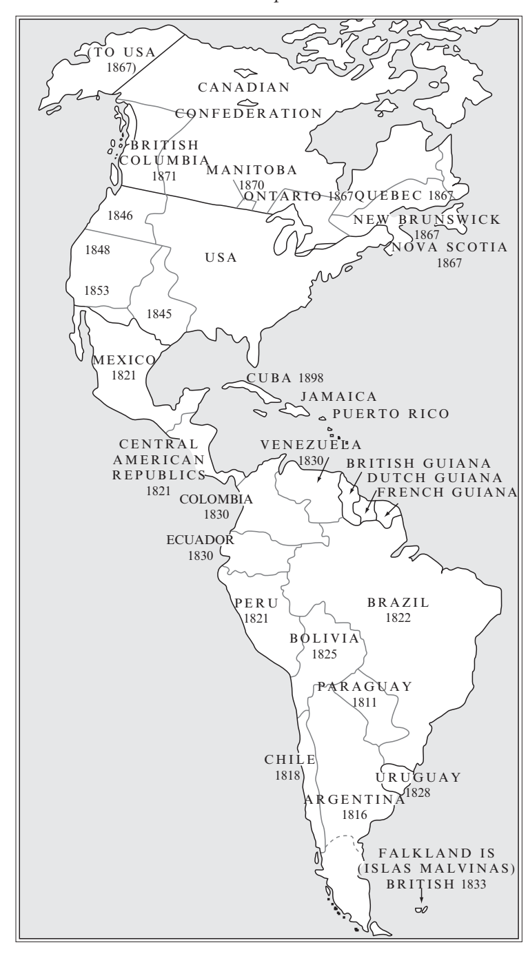
Map 1 Nineteenth-century America (based on Barraclough 1992: 101)