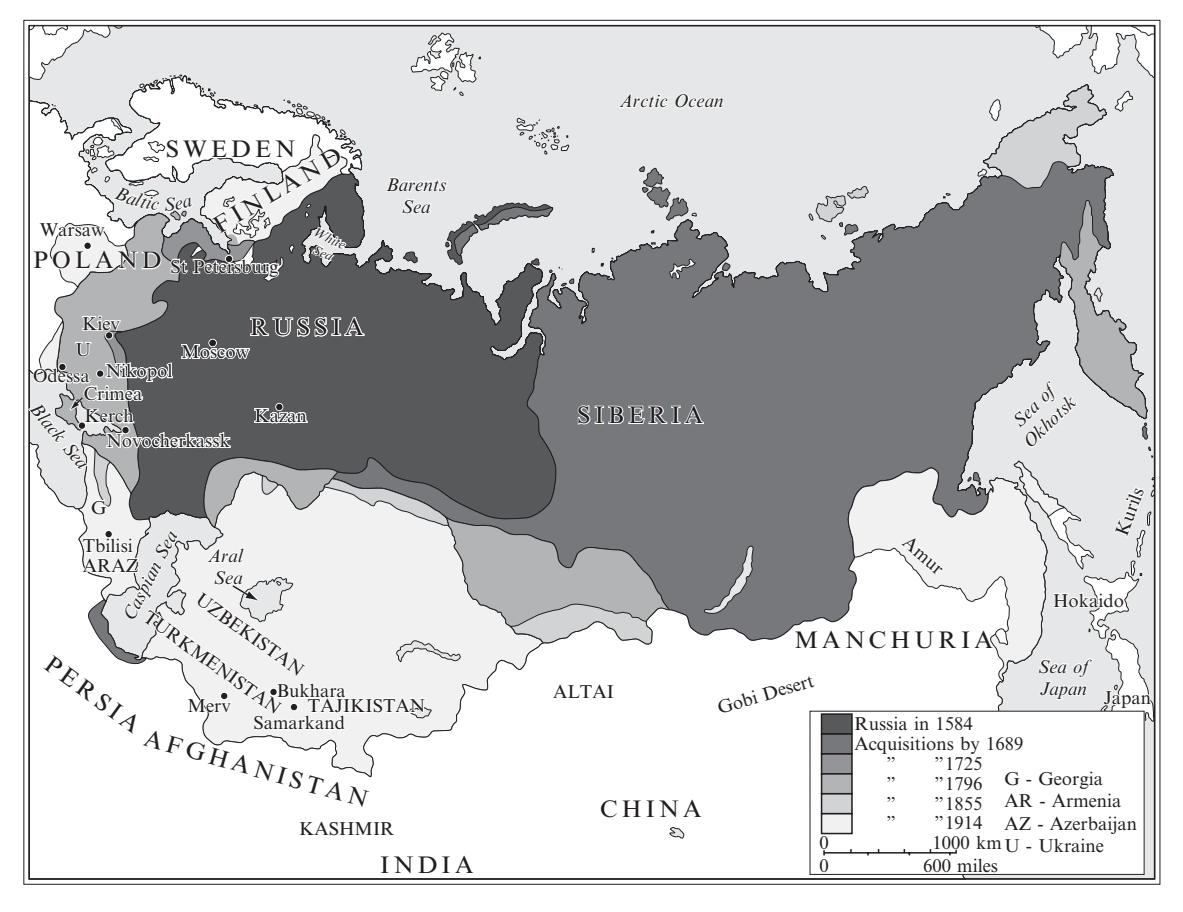
Map 4 The Russian Empire (based on Moore 1981: 70)