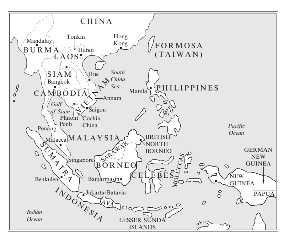
Map 3 Nineteenth-century Southeast Asia (based on Dixon 1991: map 1.1)