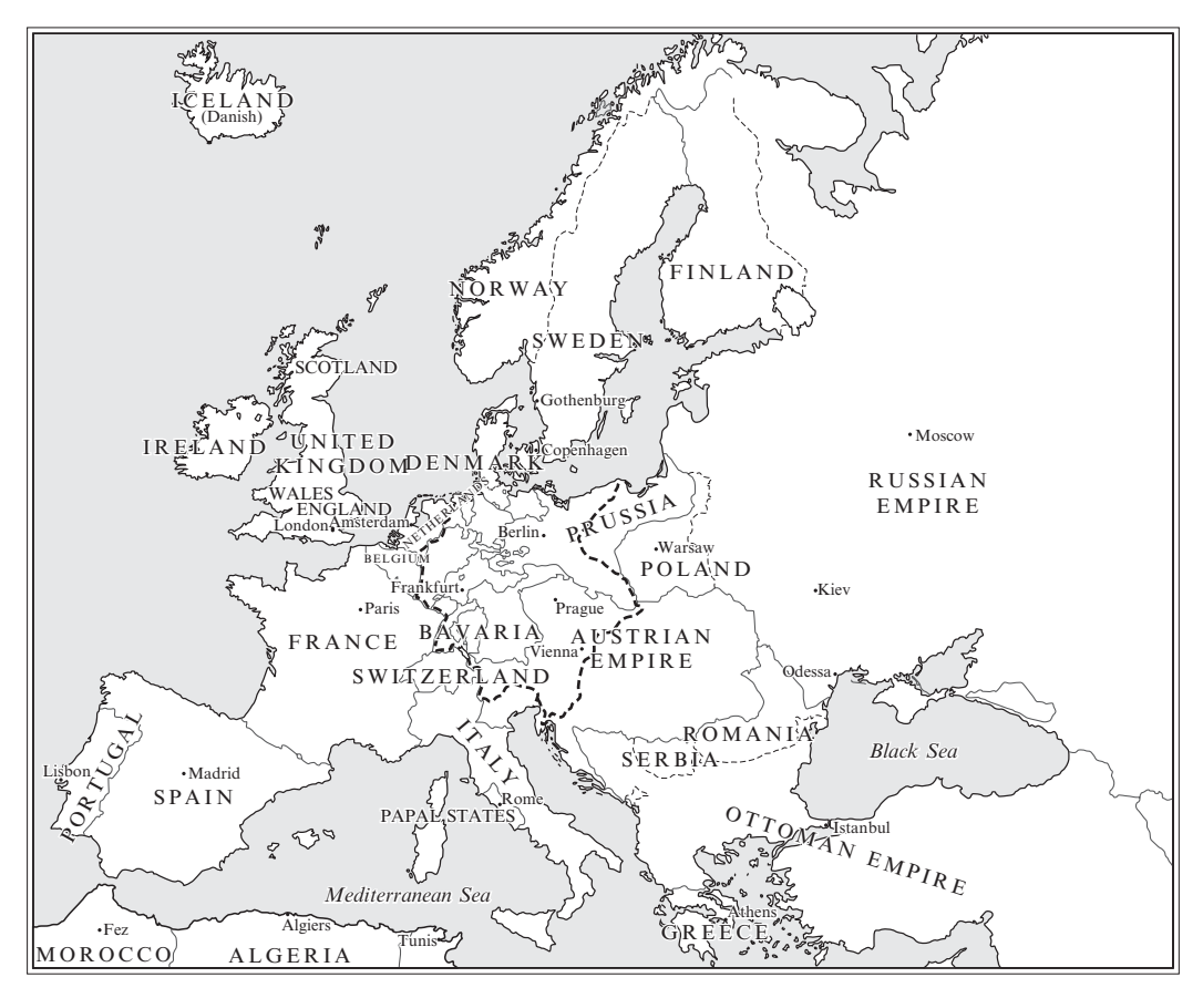
Map 5 Map of Europe in 1861 (based on The Times Atlas 1994: 156–7). The grey line encloses the German confederation