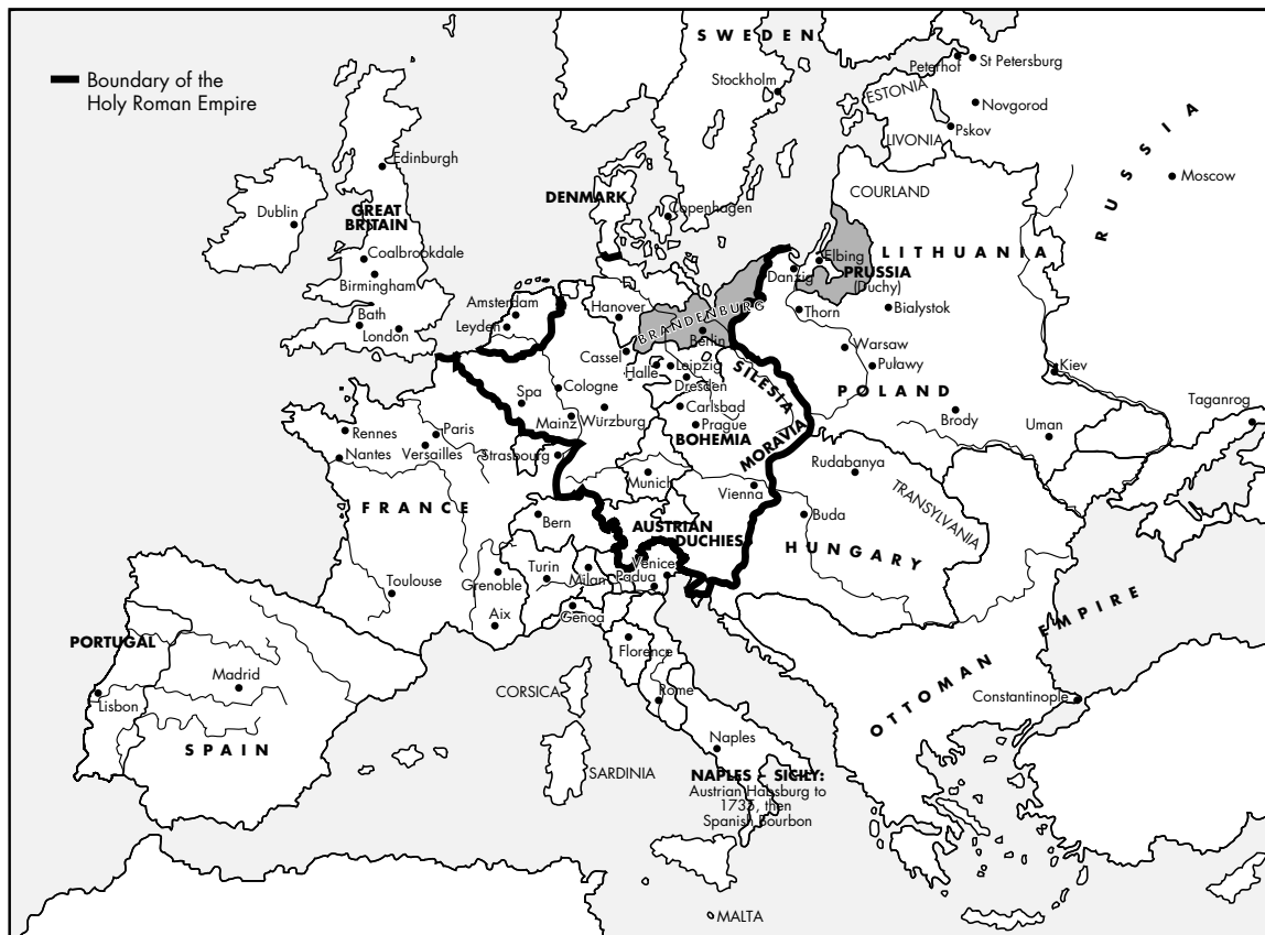
Map 1: Europe, c.1721