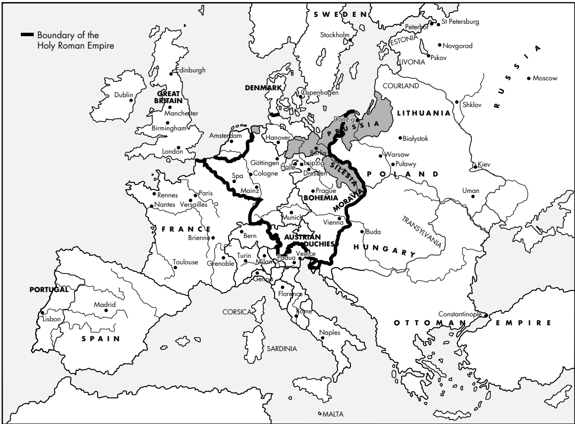
Map 2: Europe, c.1790