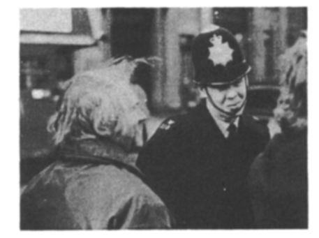
and even won sympathy from a friendly 'bobby'