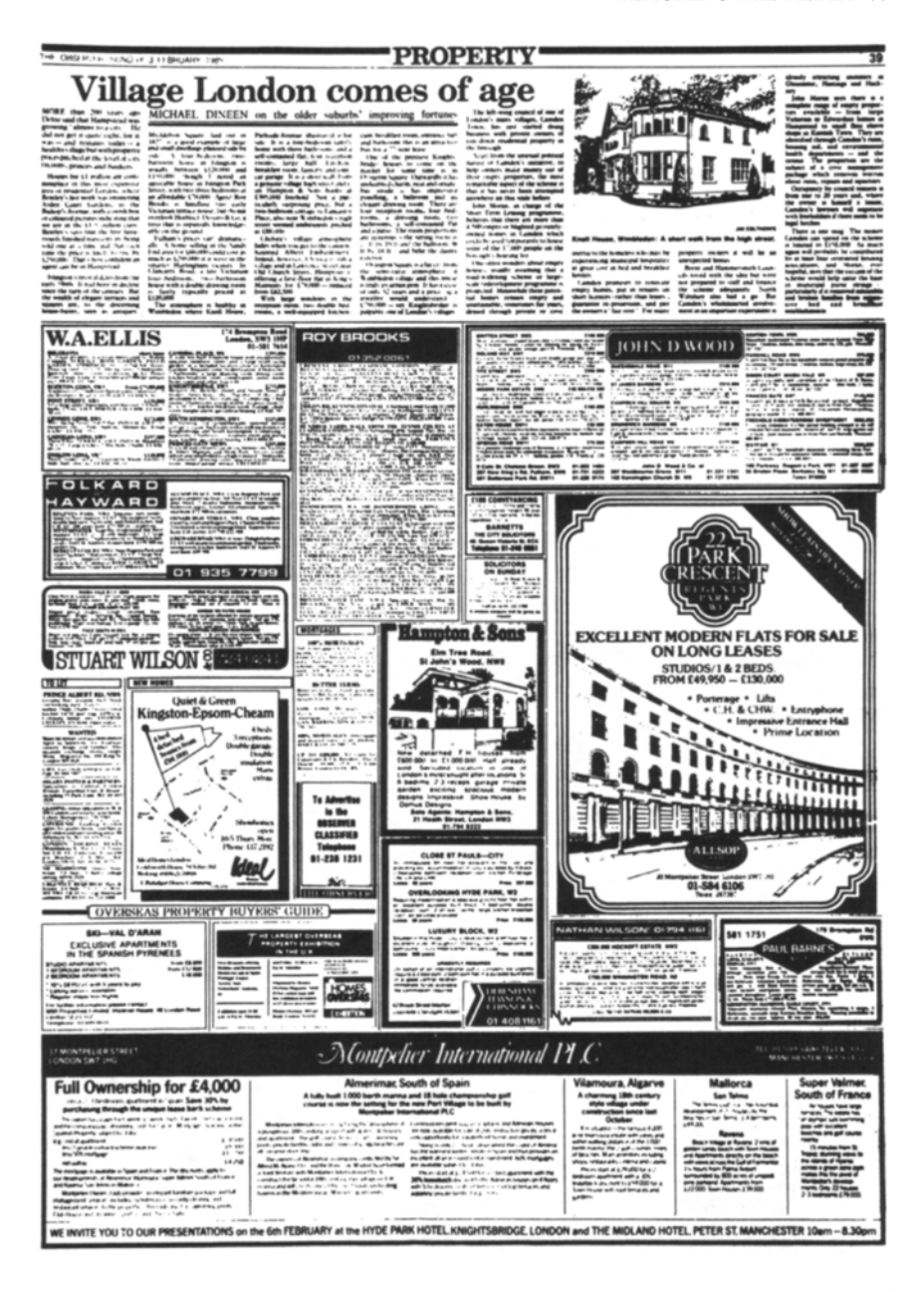
Articles act as 'hooks' to direct readers to ads, and deliver them to advertisers.

(v) As the paymasters of commercial television, advertisers obviously act as a powerful pressure group upon the television companies. In the constant