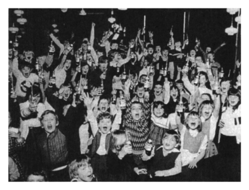
The 'kid appeal' of many local newspaper photographs has economic determinants. This picture could sell up to 200 extra copies of the paper to parents, grandparents, aunts and uncles.

fees, and provided an independence from government much greater than it enjoys today.