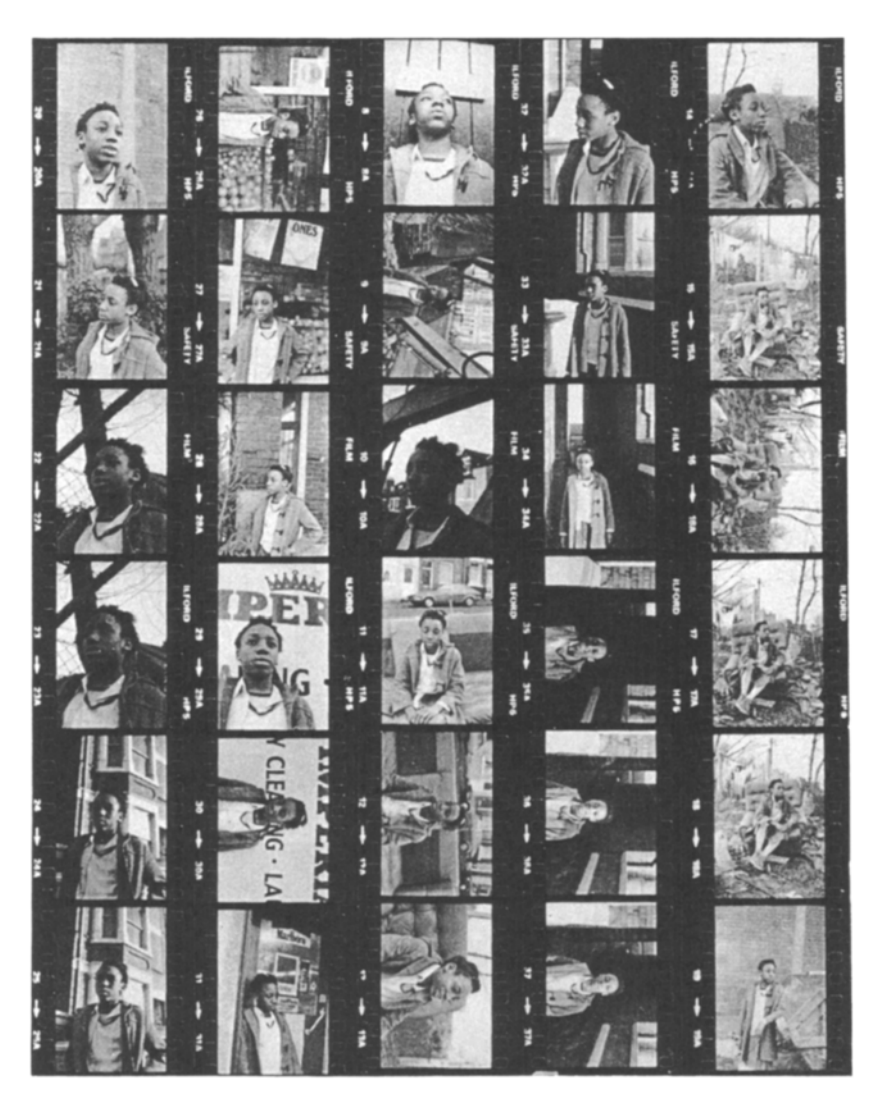
Which photograph would be most suitable as a cover for Marisa's volume of poetry?

which we can give to the final two images, and produce two diametrically opposed readings of them.