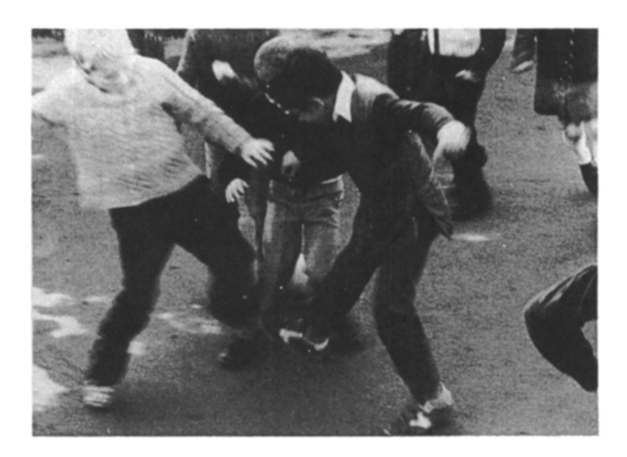
These final two images in both sequences (see previous pages). How far are our interpretations of them determined by the images which precede them?