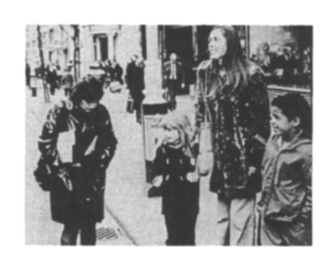
As well as from parents, brought along by their children to support the teachers.

Parents who found their hands unexpectedly full as children had the day off school. In some areas vandalism was reported as children roamed the streets