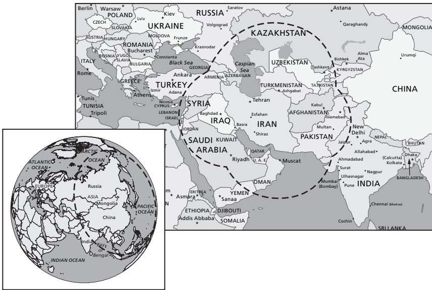
Figure 3.1 Maximum Ranges of Operational Iranian and North Korean Ballistic Missiles, c. 2010

tary aircraft. Neither Iran nor North Korea possesses intercontinental-range bombers, and the missiles that they have actually deployed to date are assessed to have a maximum range (see Figure 3.1), carrying a plausible nuclear payload, of 1,300 km. 12 North Korea is developing the longer-range Taepo Dong 2 missile which, though highly inaccurate, is thought to be capable of delivering a nuclear warhead to Alaska or Hawaii. North Korea has also been working to extend the range of its missiles in order to be able to reach the west coast of the