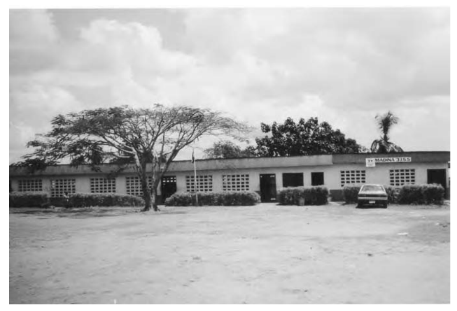
Figure 2. Madina, Ghana: Junior Secondary School #3 (1997).