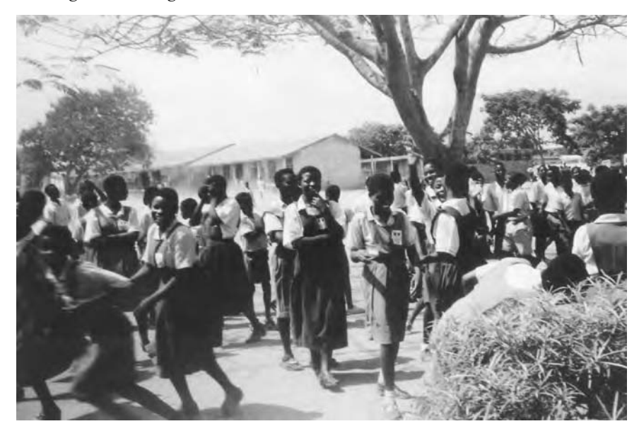
Figure 1. Madina, Ghana: Junior Secondary School #3 students on break, 1997.