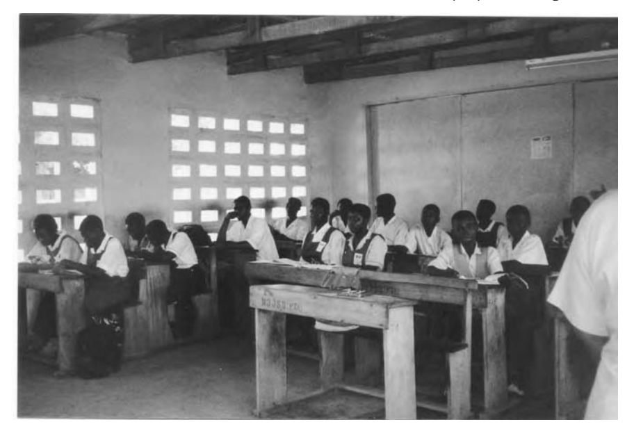
Figure 3. Madina, Ghana: Junior Secondary School #3, Year 3 class, 1997.